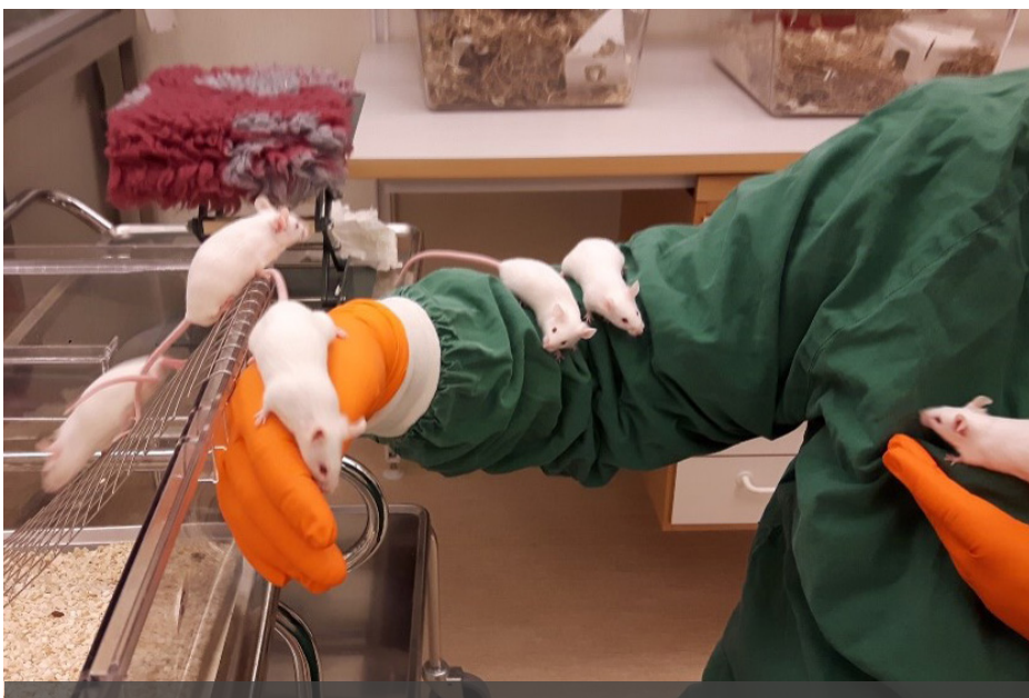
Habituated mice voluntarily interact with the handler, even after procedures.