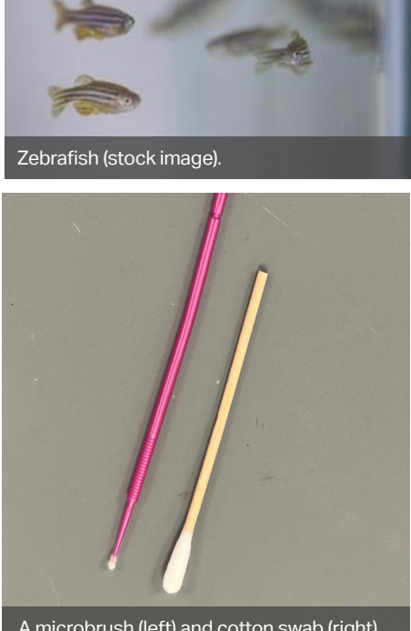
A microbrush (left) and cotton swab (right).

My advice to anyone looking to make an impactful change for the animals in our care would be collaboration - this project included input and feedback from many different groups at our site. Our zebrafish knowledge, combined with our Animal Welfare and Veterinary experts, Scientists, and Novel Technical Procedures team worked together to achieve this refinement.